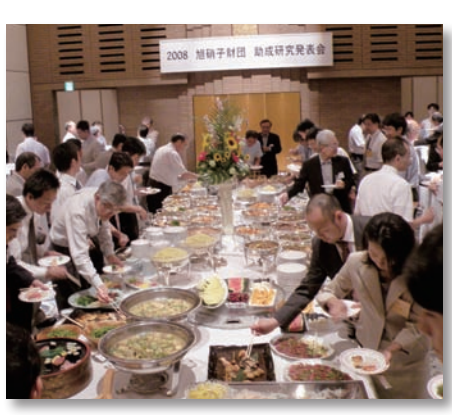
Party after the seminar