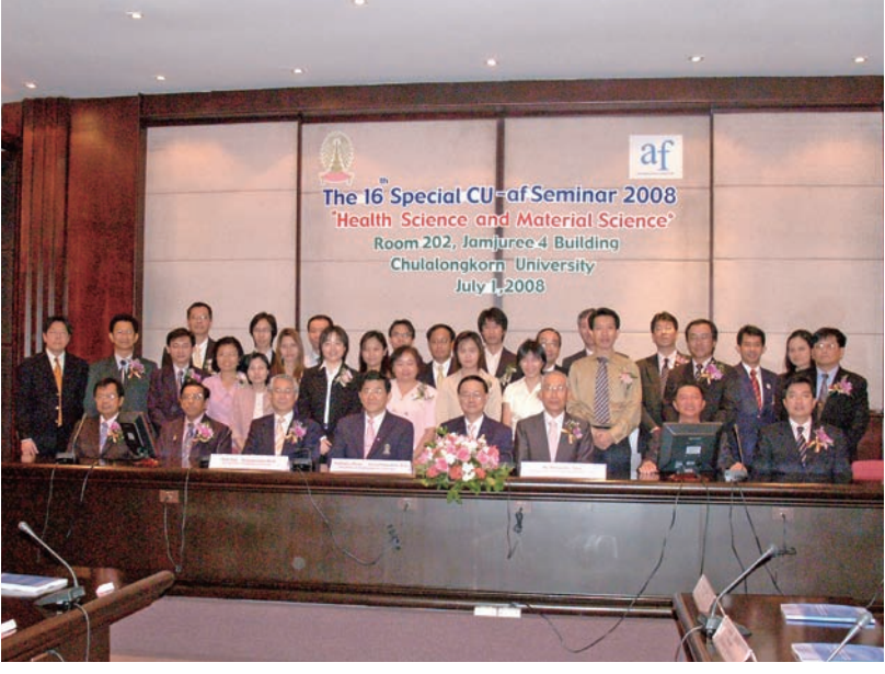
Grant recipients with Chulalongkorn University and Asahi Glass Foundation personnel