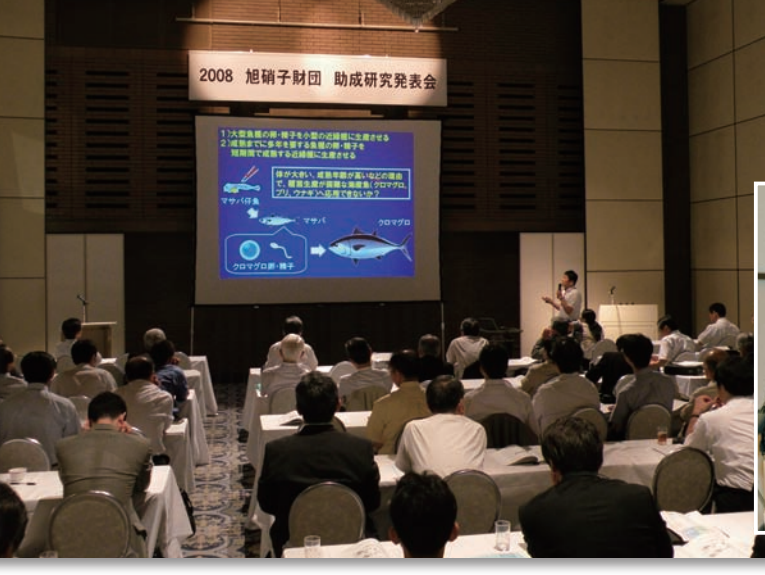
Three-minute speeches in the presentation hall