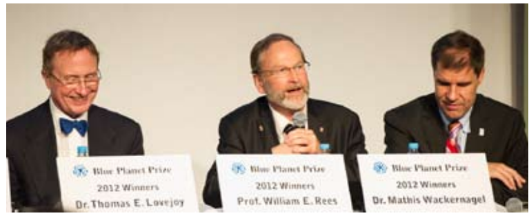
One of this year's Blue Planet Prize winners speaking on stage

Nominators from around the world nominated candidates, who were carefully screened by the Selection Committee. The Presentation Committee held discussions on the candidates and the winners were subsequently decided at the Board of Directors and Councillors Meeting held in April this year.