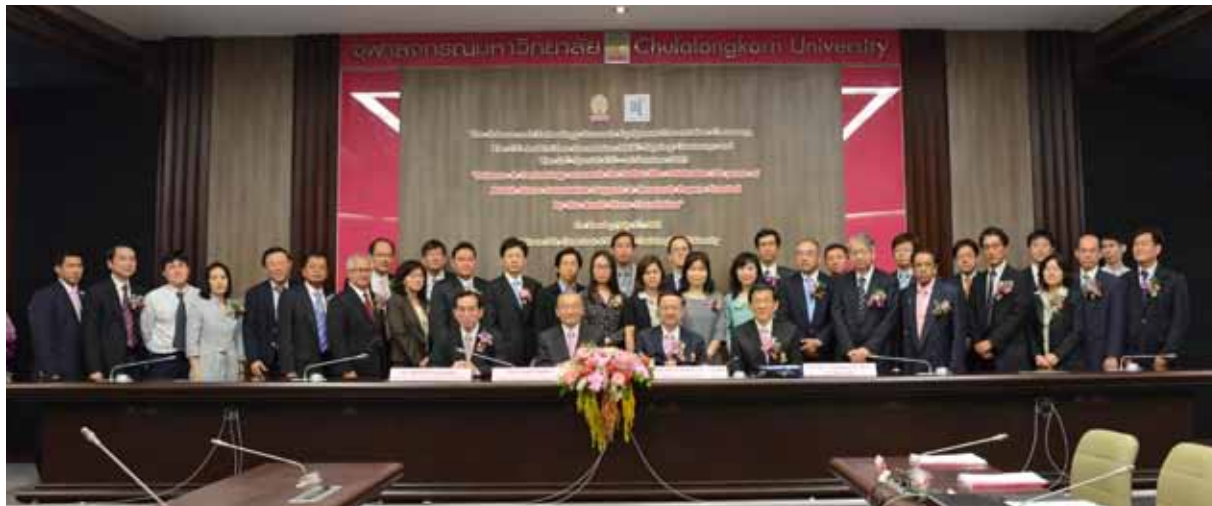
Grant recipients and associated people from CU and the Asahi Glass Foundation