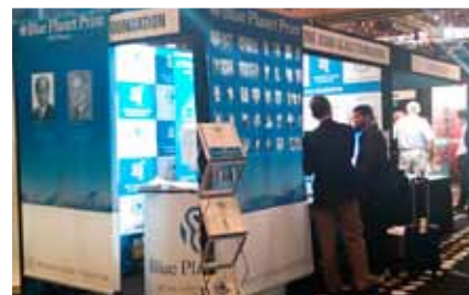
June: The Foundation booth at AOGS