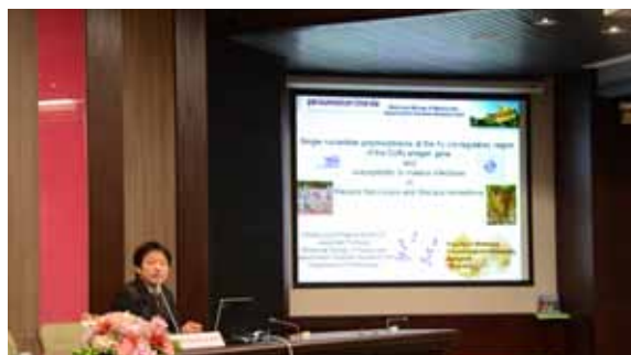
A presentation of research results given at the seminar