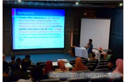
Presentation of research results