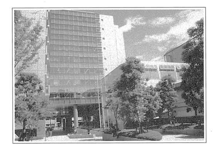
The Asahi Glass Foundation's home is in Tokyo's Science Plaza Building.

The Foundation strives to contribute to the creation of a richer, more vibrant society. To this end, it supports research in leading-edge scientific and technological fields and recognizes individual and organizational efforts to solve issues of concern to people around the world.