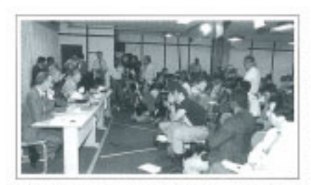
Press conference at the Earth Summit in Rio de Janeiro.