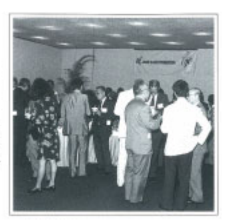
* UNCED = United Nations Conference on Environment and Development All personal titles refer to positions held at the time.