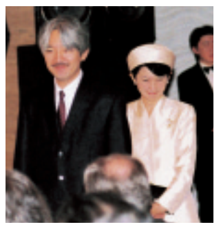
Their Imperial Highnesses Prince and Princess Akishino at the Awards Ceremony