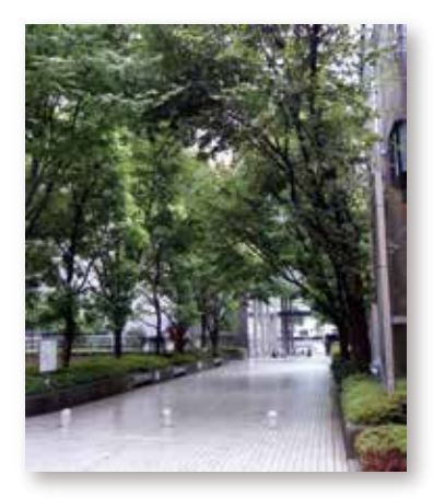
Science Plaza south entrance (Coming from the Joshi Gakuin side)