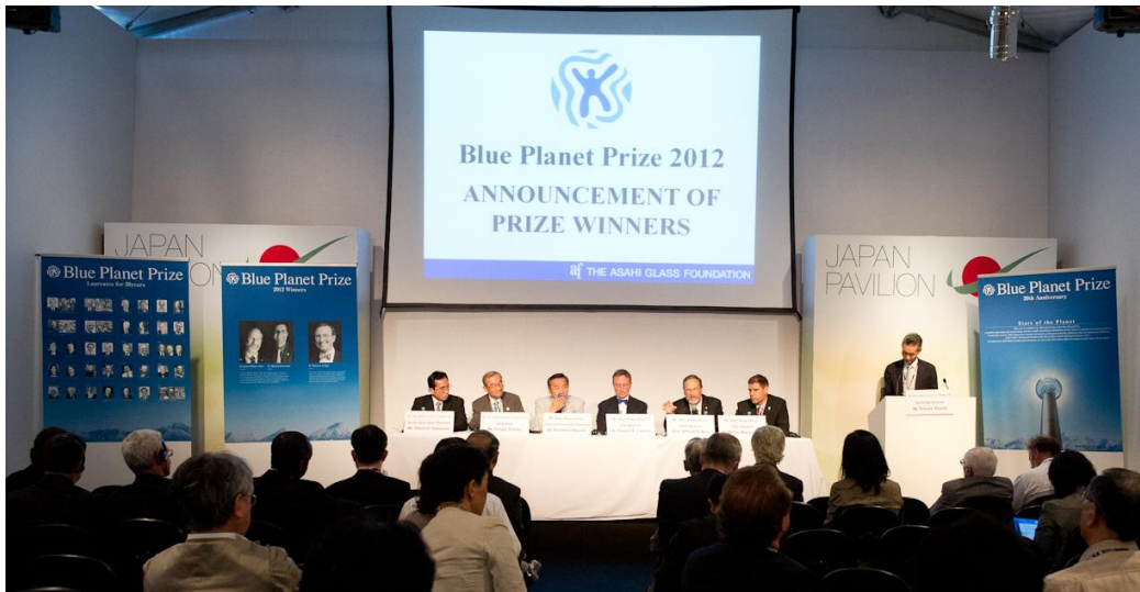
Press conference with winners at Rio+20 in Rio de Janeiro, Brazil.