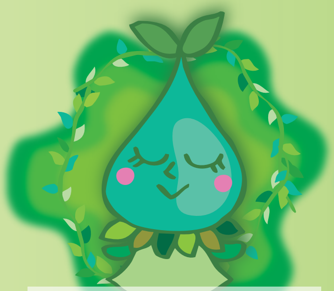
I named this water in the soil "green water,"