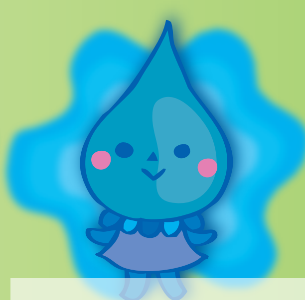
and river water "blue water."